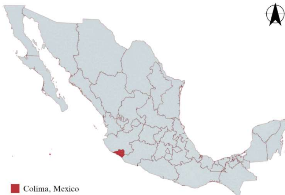
Figure 1: Location of the state of Colima within Mexico.

The study site is located in the state of Colima, Mexico (Figure 1), where years ago there was a plant that handled 1,2-dichloroethane in its process, and it was found that the disposal of hazardous waste was stored in pits with totes.